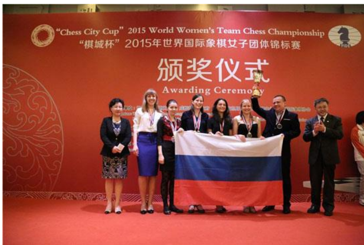
Russia took silver