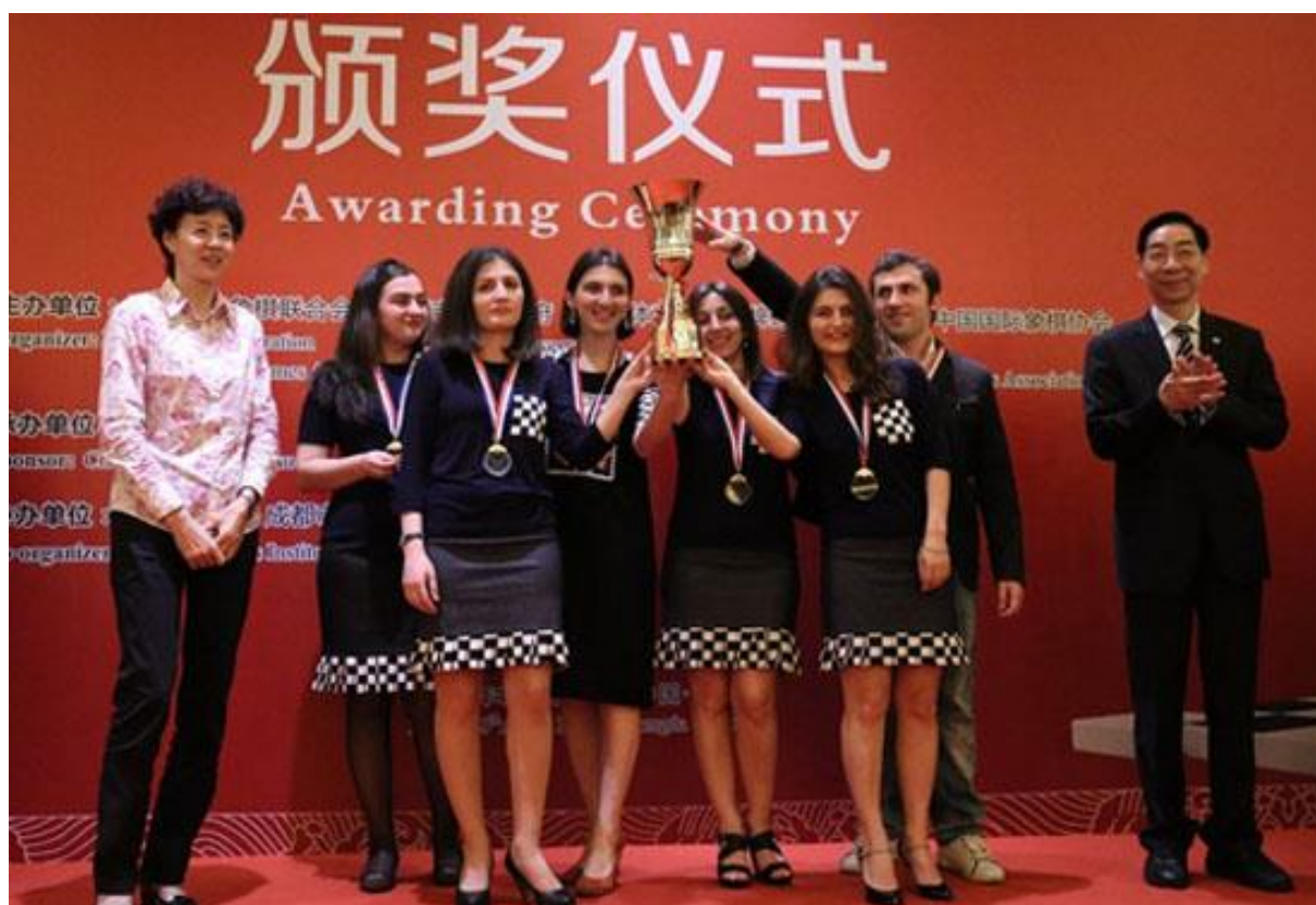
Georgia – the surprise winners