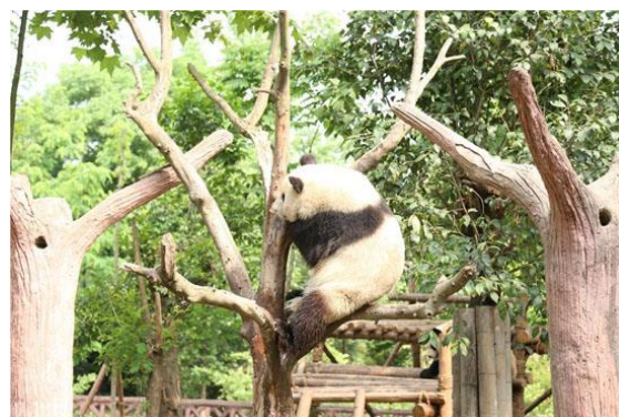
Neither player nor spectator but the free day