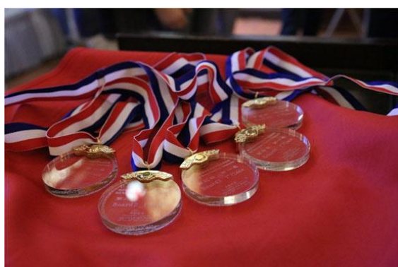
Board prize medals