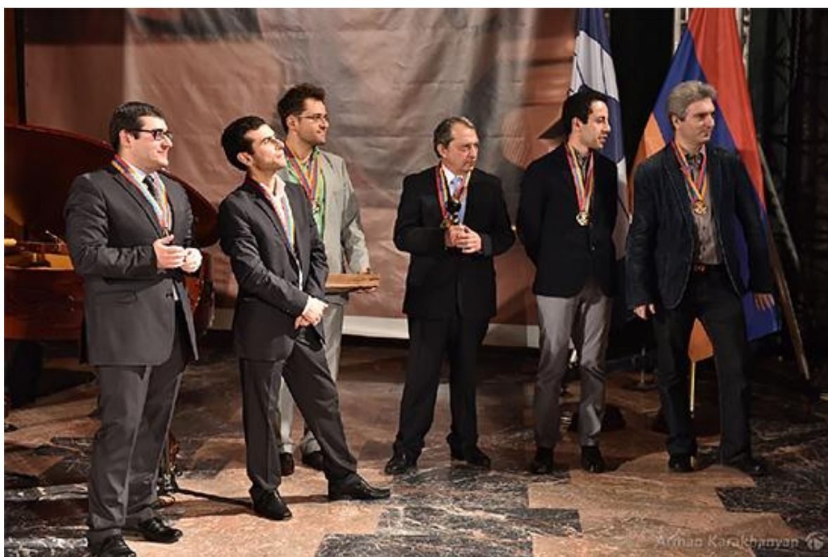
Armenia - bronze

Star of the show was China's 15-year-old WEI Yi.