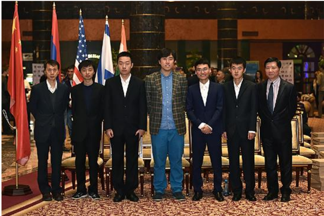
The victorious Chinese team