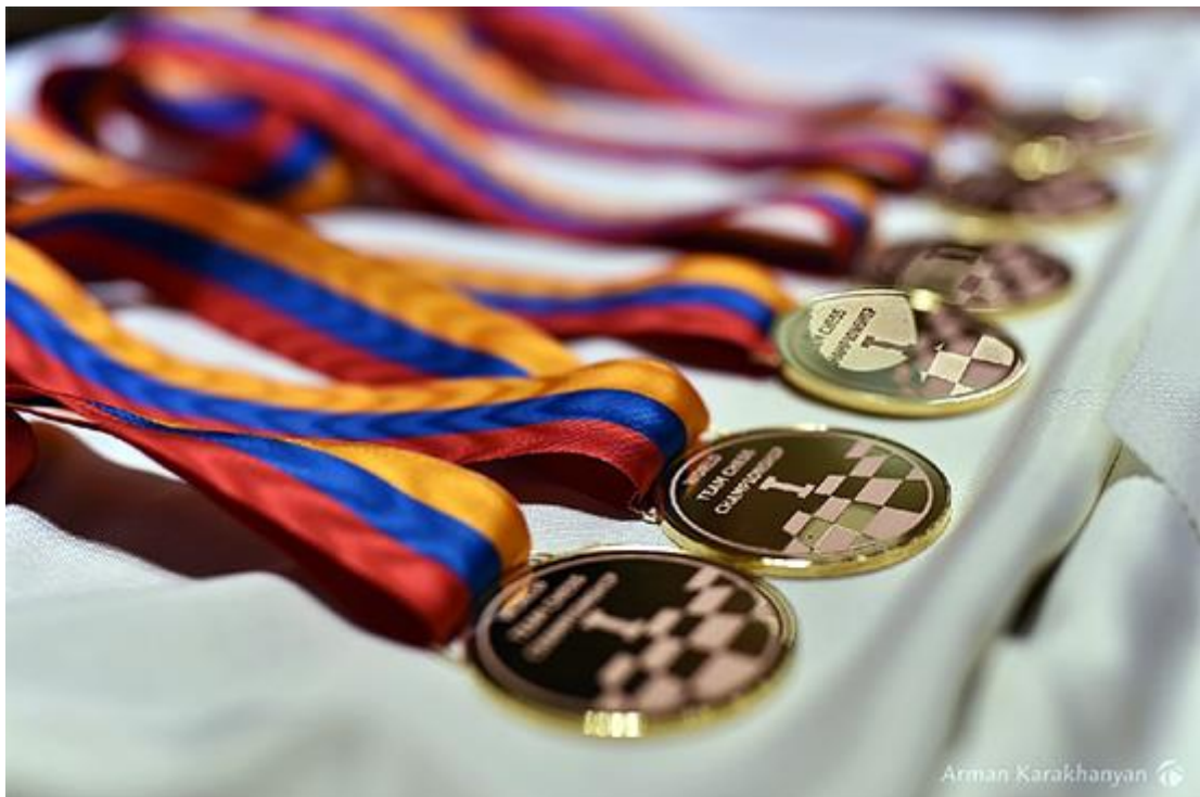
The coveted medals