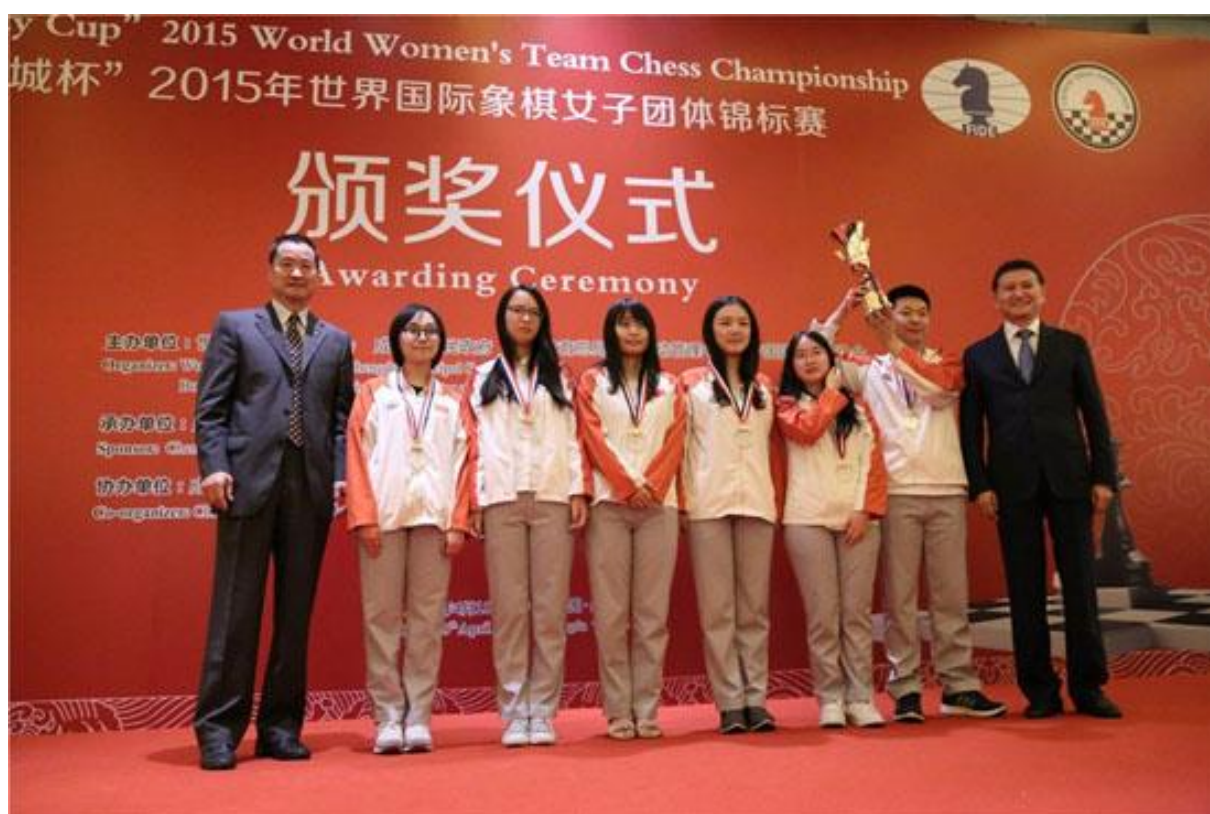
Home team China had to settle for bronze.