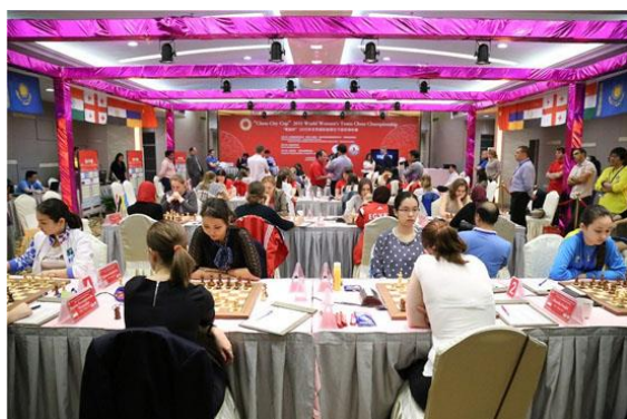
The playing hall